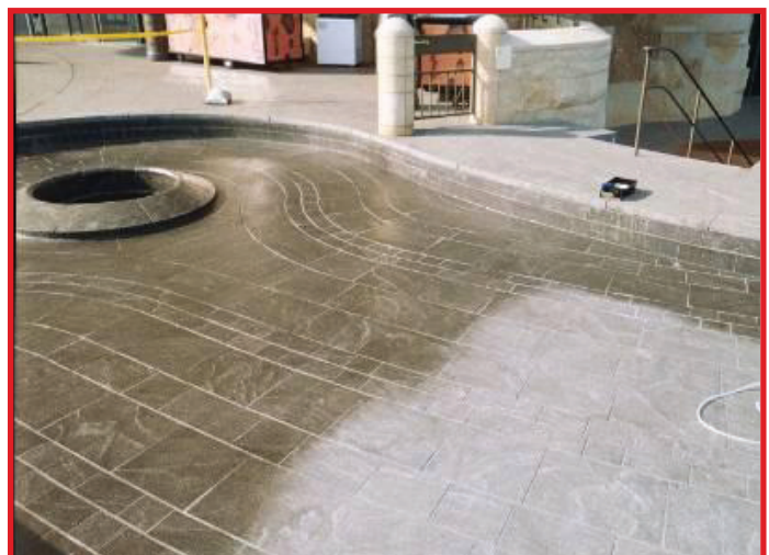
After treatment with MicroGuard®

Situation: The hot and dry summer of 2005 took its toll on the outdoor “Indian River” at the Smithsonian, Washington D.C. Algae and bacteria began to grow and multiply in this slow-moving water exhibit. After failed attempts at cleaning the granite, Applied Surface Technology was called to recommend a solution.