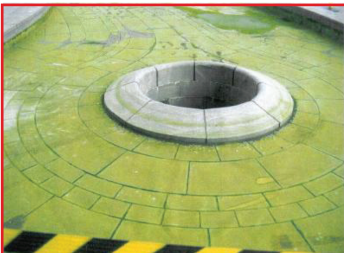
Before treatment with MicroGuard®